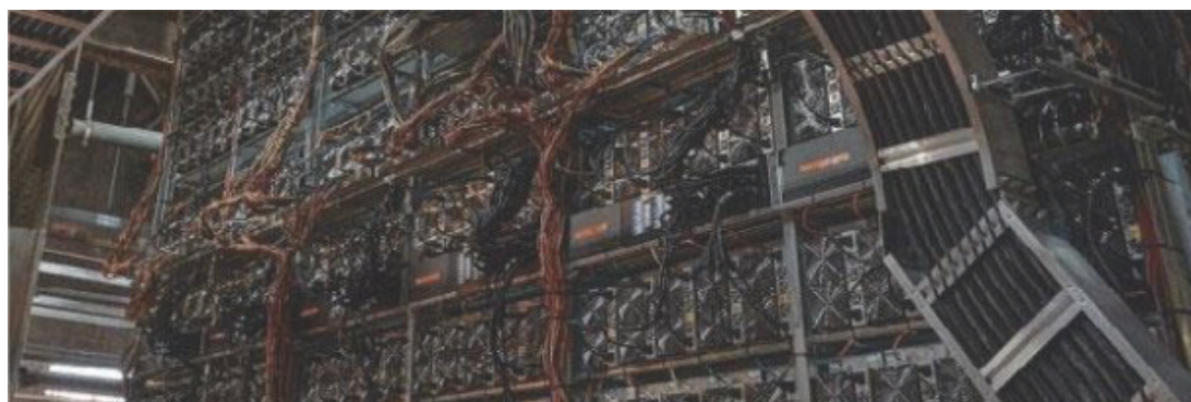
Bitcoin mining equipment installed within the Town of Torrey, NY mining facility.

With the full deployment of these new miners, our total fleet is expected to comprise approximately 32,500 total miners and is expected to utilize approximately 95 MW of electricity. The new advanced miners have substantially greater hash rate capacities and use electric power more efficiently than our existing miner fleet. With the deployment of the aforementioned miners in 2021, we expect to be able to achieve a total hash rate capacity of at least 1.4 EH/s by the end of 2021. After deploying all of our miners contracted to be purchased, we expect to achieve a total hash rate capacity of approximately 2.9 EH/s. While there is a possibility supply side constraints impact the ability of our suppliers to timely fulfill our open orders, we do not anticipate any supply side constraints to impact the ability of suppliers to deliver on the remaining miners not yet manufactured. See “ Risk Factors—Risks Related to Our Business—Bitcoin and Cryptocurrency Related Risks. ”